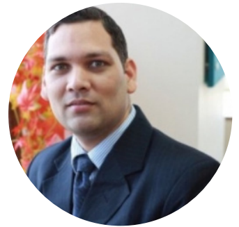
Vipin Private Investments